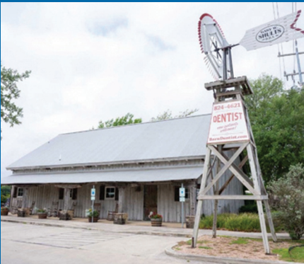
The Barn Dental Office in San Antonio