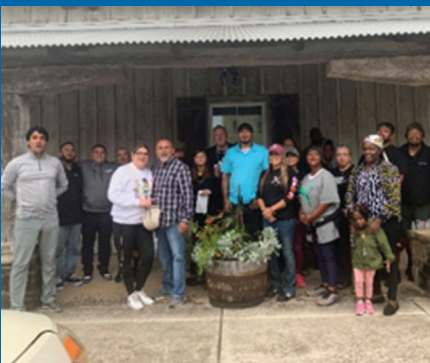
Patients are pictured on the front port of The Barn Dental Office in San Antonio in November.