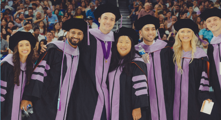
UTHealth San Antonio School of Dentistry graduates at their ceremony on May 17.

She also reminded the graduates not to forget that their experiences extend beyond themselves.