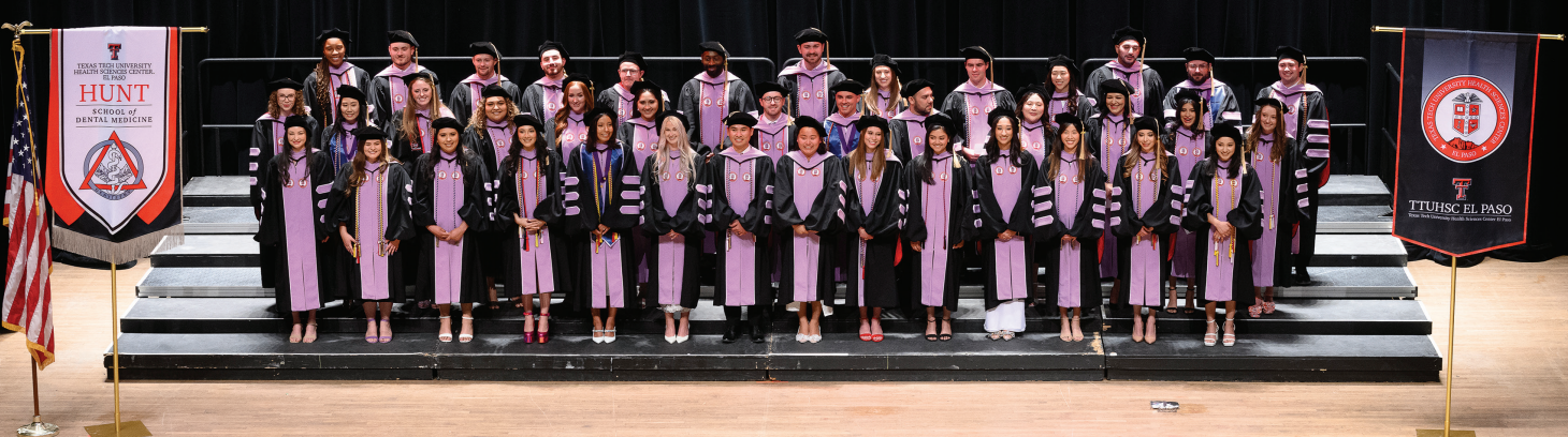
The inaugural graduating class of the WLHSDM, the state’s first new dental school in 50 years.